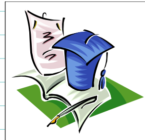
Senior Year-Here I Come!!!!

I hope that you are having a wonderful, successful Junior Year!!