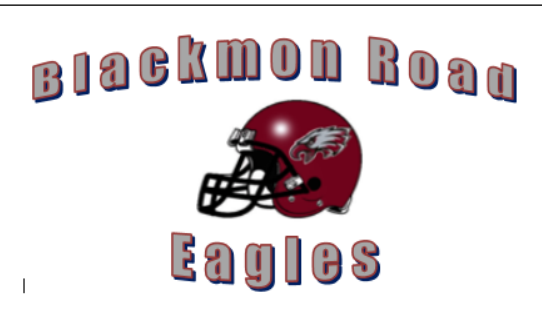
2021 Football Schedule