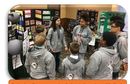
Robotics Team won the Judges' Award at GA Tech State Championship for FIRST LEGO League