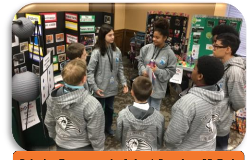
Robotics Team won the Judges' Award at GA Tech State Championship for FIRST LEGO League