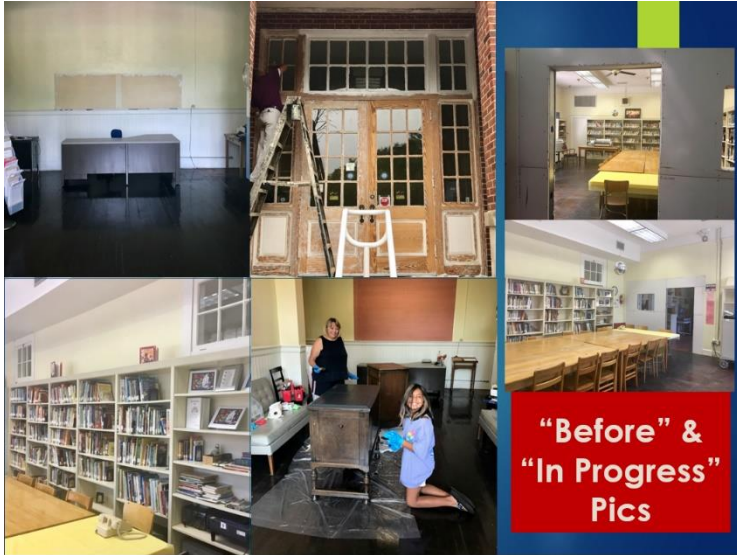
“Before” & “In Progress” Pics